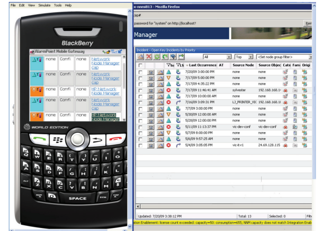
View all critical incidents in real time from any mobile device

Making smart investments in network automation, configuration, provisioning and management? Seems like a sound strategy, that is until something goes wrong. Then we need to get the smart people involved, quickly. That's where the magic happens. The combination between HP NNMi and the xMatters relevance engines enables your smart people to quickly receive, diagnose and restore services from a Football game or any other location. Whether or not you consider yourself a "relevance revolutionary" or just a really smart IT professional bent on change we can assist.